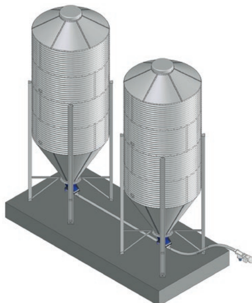
Flex Vey tandem system for two silos