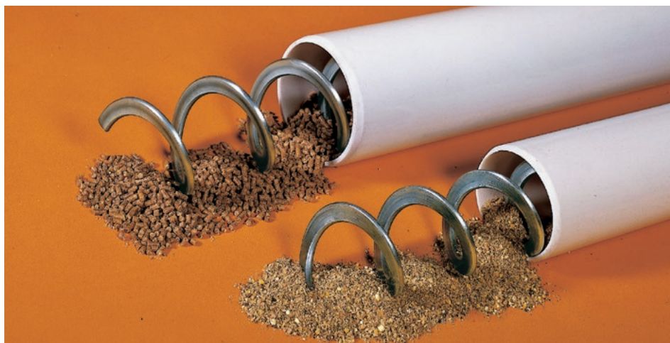
Flex Vey conveyor spirals – simple and flexible conveying systems