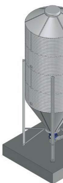
Vertical and cross