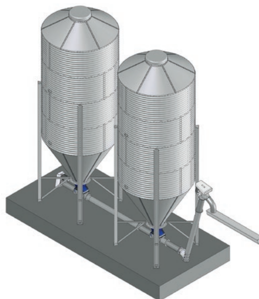
Tandem auger and forced transfer