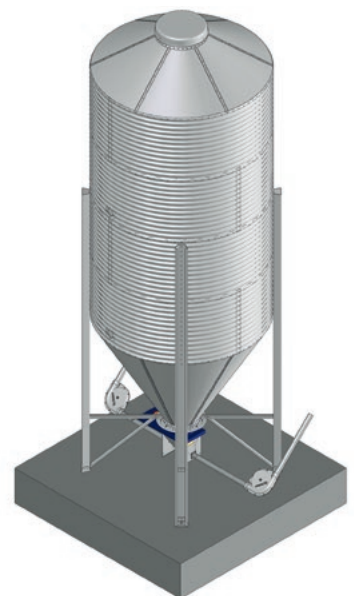
Conveyor chain (DR 850/DR 1500)